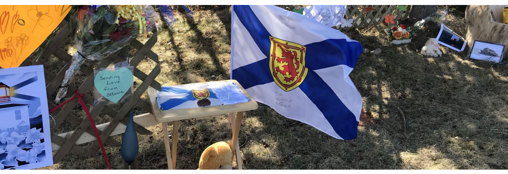
Portapique church hall memorial.