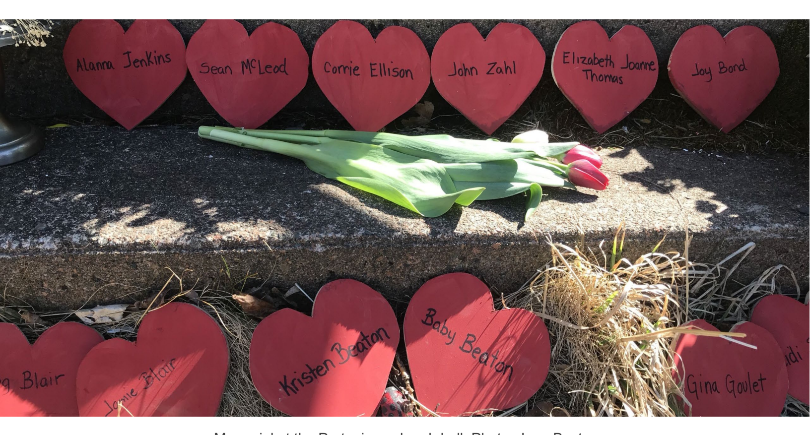
Memorial at the Portapique church hall.

... however, like I said, it just takes one perfectly reasonable hunting rifle with one bullet in it to kill a woman, if a man wants to kill his partner. The fewer guns, the less femicide we would have involving guns, writ large.