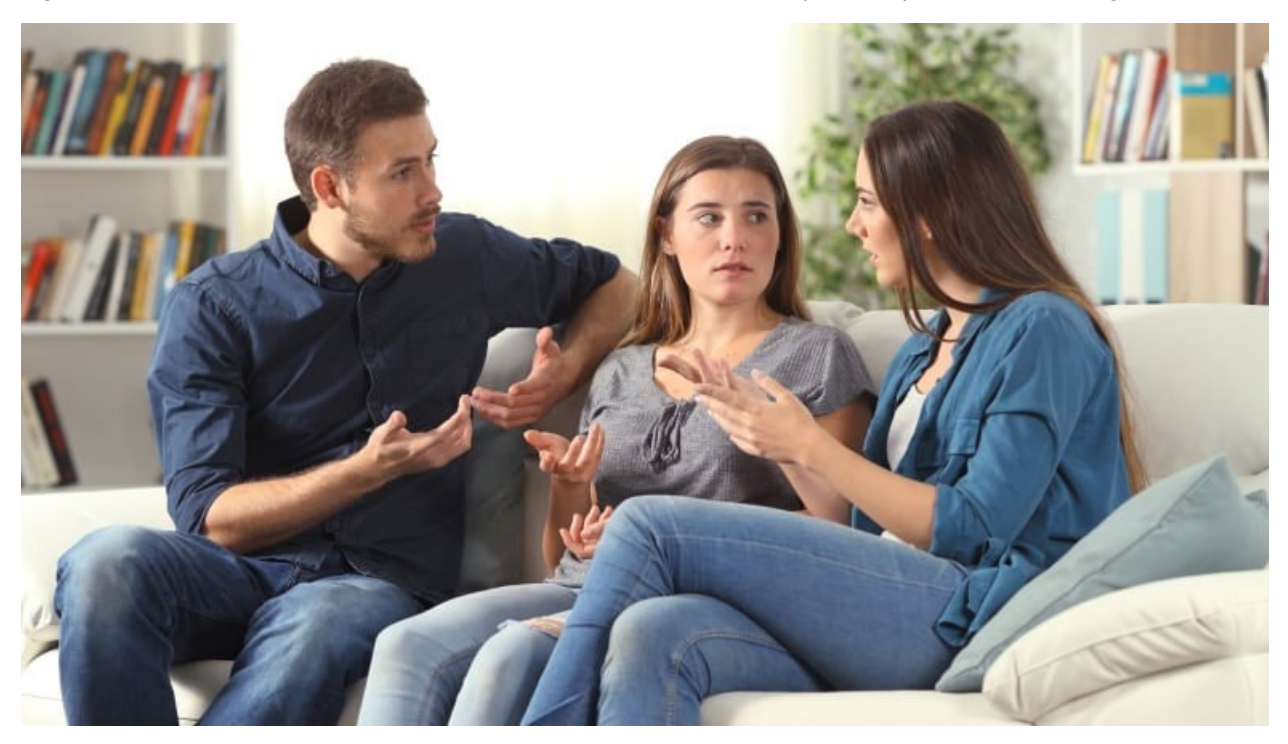
Experts recommend trying to maintain decorum when having a conversation with someone who opposes your views about COVID-19 mandates.

Aly Thomson · CBC News · Posted: Feb 13, 2022 6:00 AM AT | Last Updated: February 13