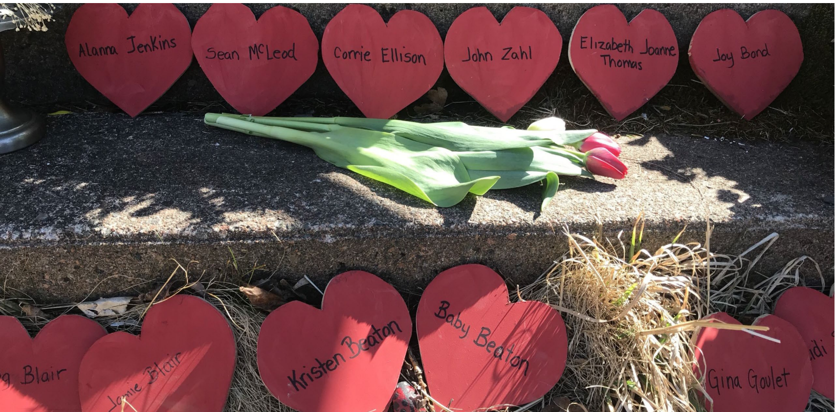
Memorial at the Portapique church hall.

... however, like I said, it just takes one perfectly reasonable hunting rifle with one bullet in it to kill a woman, if a man wants to kill his partner. The fewer guns, the less femicide we would have involving guns, writ large.