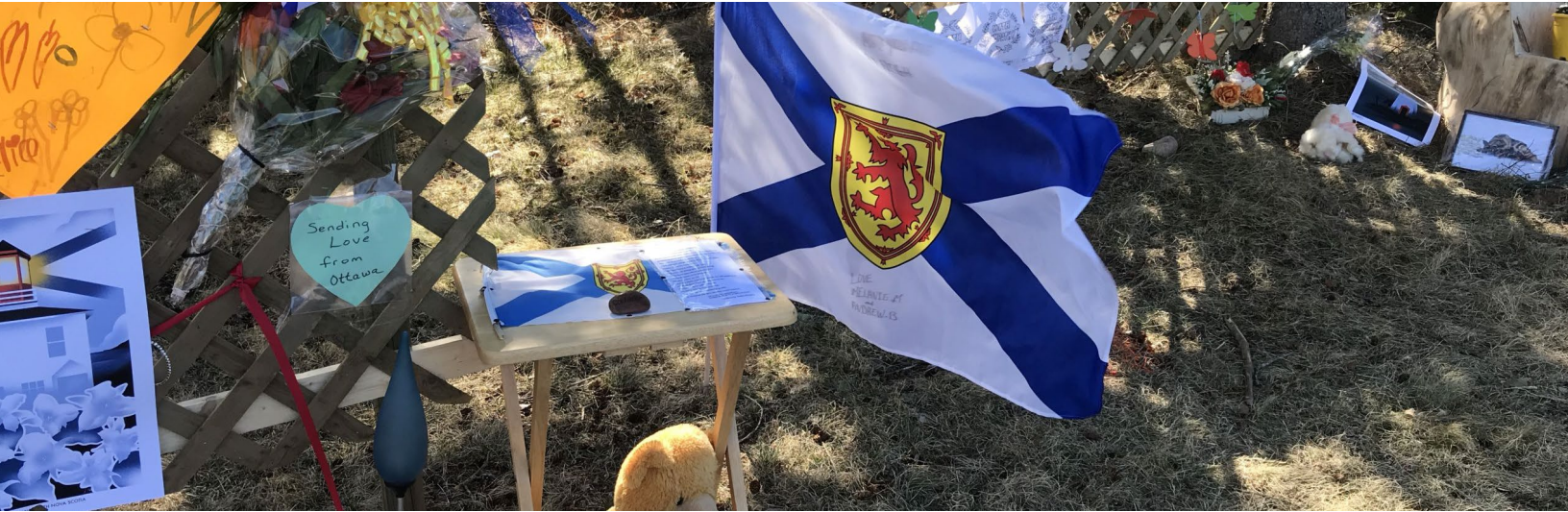
Portapique church hall memorial.